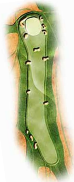
Muirfield's 15th... home to 13 devilish little traps.

Ask any top player to highlight Muirfield's greatest challenge, and they'll tell you the same thing – its bunkers. They are among the finest in the world, in terms of their shape, variety and positioning. Finding one will invariably cost you a shot and their size is magnified by delicious contours that further narrows the margin for error in selecting the correct line off the tee, or into one of the notoriously small greens. When Nick Faldo won his third Open here in 1992, he heeded Jack Nicklaus' personal advice: "Stay short or long of them."